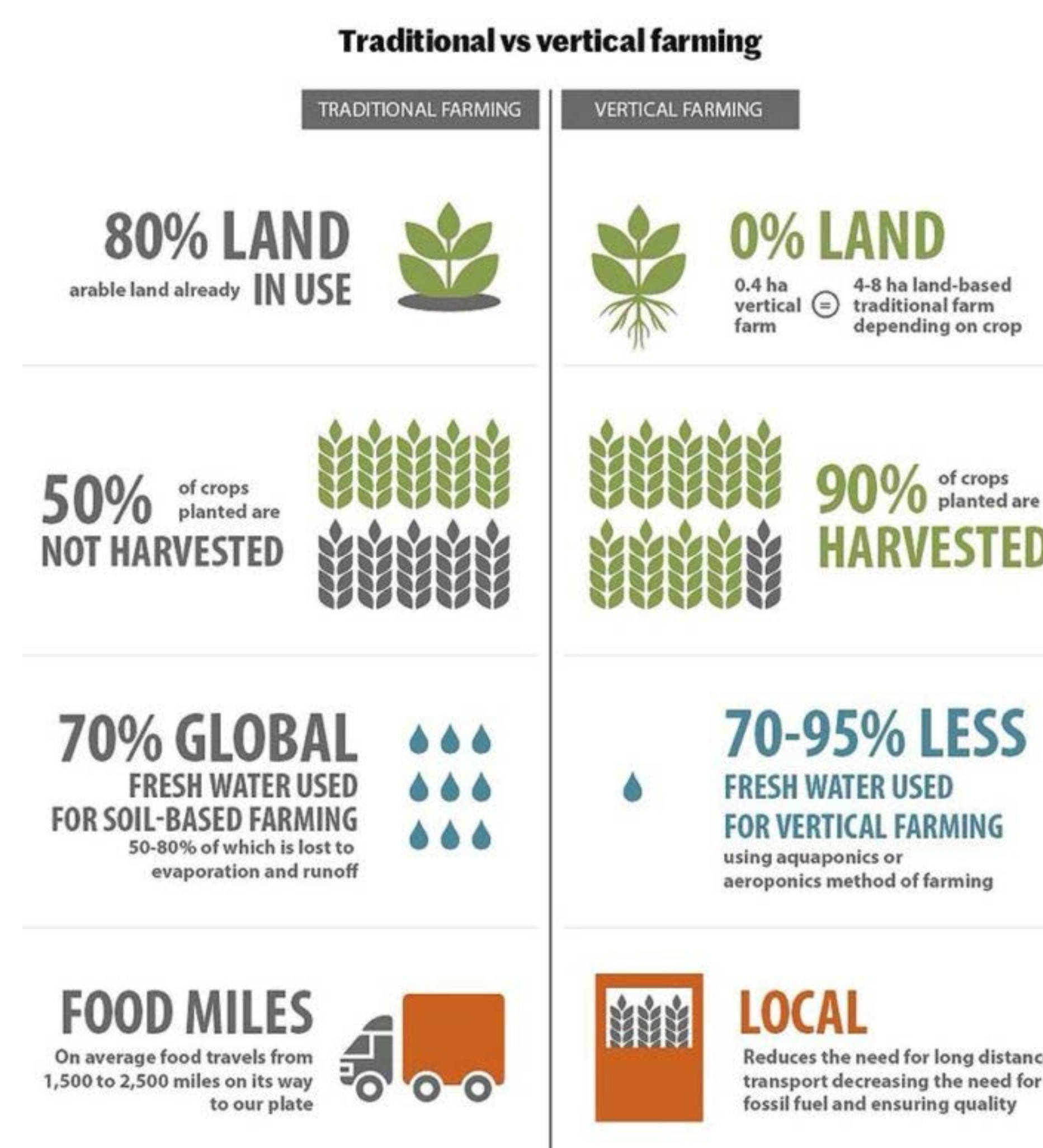
Figure 3. Traditional vs Vertical Farming Infographic